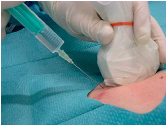
► Fig. 3 Correct application of the sterile ultrasound probe cover in a freehand biopsy with possible contact between the needle and the ultrasound probe. The examiner is wearing sterile gloves. A sterile drape/incise drape as a barrier precaution is obligatory when tools (e. g. syringe) must be changed/set down during puncture.