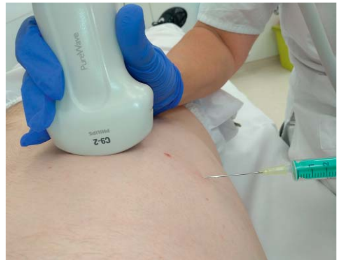
► Fig. 2 A safety distance between the ultrasound probe and the sterile needle is maintained in this freehand biopsy. If the examiner can ensure that the needle will not come into contact with the ultrasound probe, a sterile ultrasound probe cover is not necessary.

after every use is sufficient here. Disinfectants with only bactericidal and yeasticidal (yeast killing) activity are to be used.