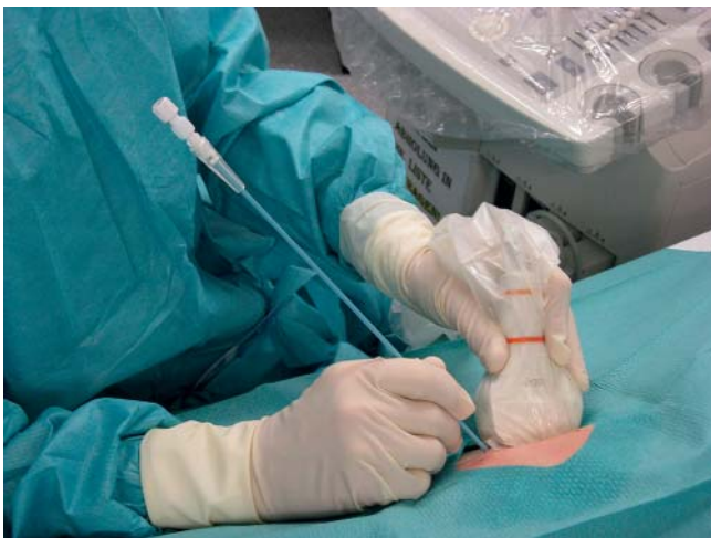
► Fig. 4 Placement of an abscess drainage tube. Ultrasound probe, cable, and keyboard are covered with sterile covers. Following hand disinfection, the examiner is dressed as in a surgical situation. A sterile drape/incise drape serves as the barrier precaution. A sterile ultrasound gel is used as the contact medium. A sterile work table is additionally available.

in the instructions for use. Proof of efficacy with recognized methods must be documented by an expert opinion (...)” [14]. This requirement was included in the ultrasound agreement in 2017 [36].